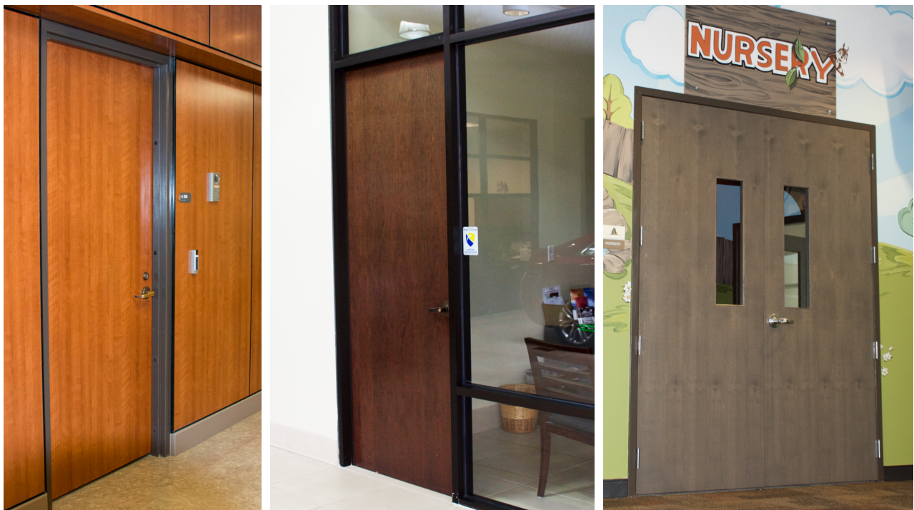
Figure 1: Images of the declared product in various applications

Oregon Door's ReCor core doors with wood veneer facing are offered in multiple configurations for just about any interior commercial opening. All commercially-available wood veneer species are available, including sketch-face, DOORfx graphic applications, and specialty options. Oregon Door's advanced manufacturing tools can also factory-machine for all hardware, glass, louver, and other applications.