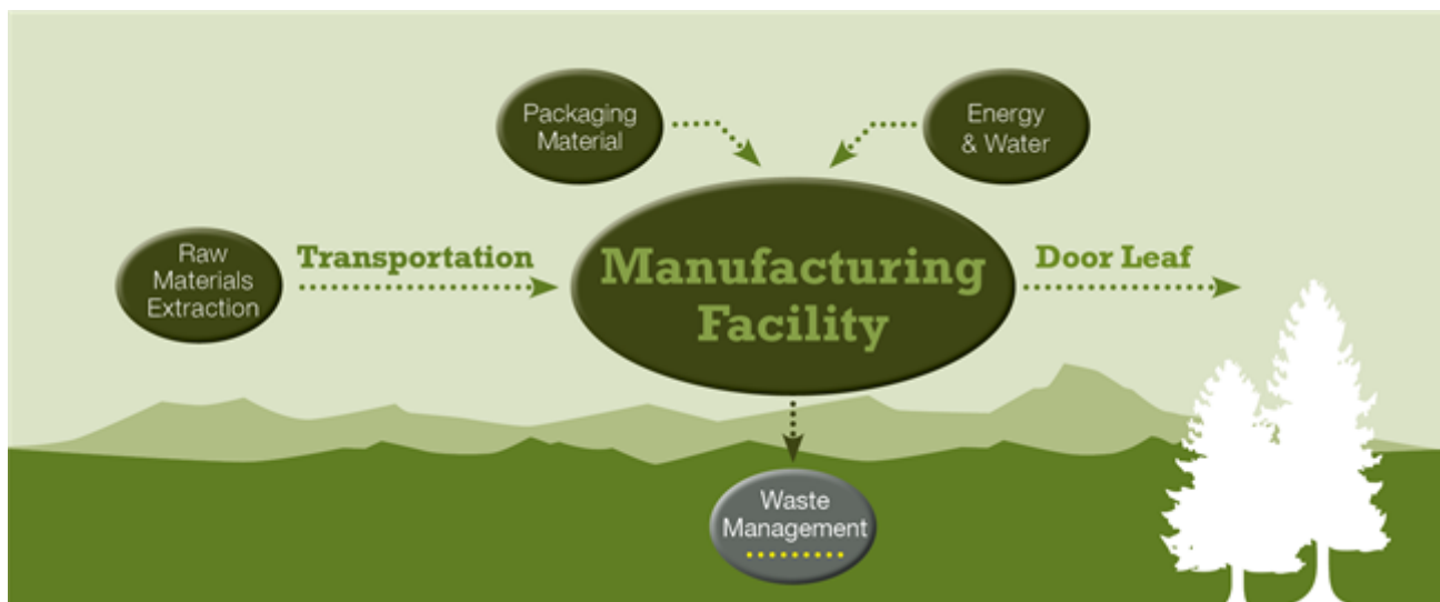
Figure 2: Input and output flows of the Oregon Door manufacturing facility

The figure below illustrates the declared product.